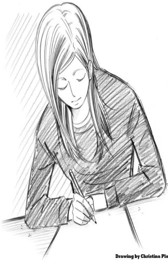
Drawing by Christina Plaka

The reasons young people give for self-harming are varied and include: